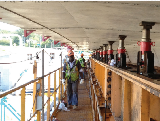
(42) HLN5508 cylinders lifting the Jordan Bridge in Cheasapeake, VA.