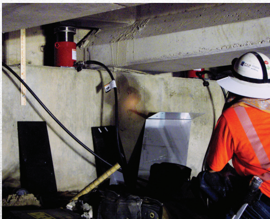
Lock Nut Cylinders lifting a bridge in Chandler, AZ