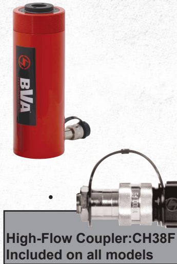
High-Flow Coupler: CH38F Included on all models

± Cylinder are equipped with carrying handles